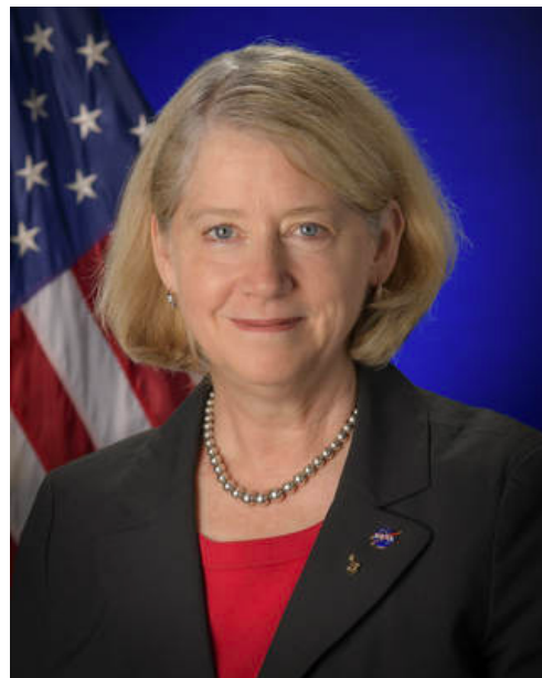
NASA Deputy Administrator Pam Melroy